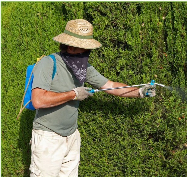
Inadequate protective equipment increases the risk of exposure.

It is important to understand the relationship between the toxicity of the pesticide product and the effect of exposure . Together, toxicity and exposure determine the amount of risk that an applicator faces.